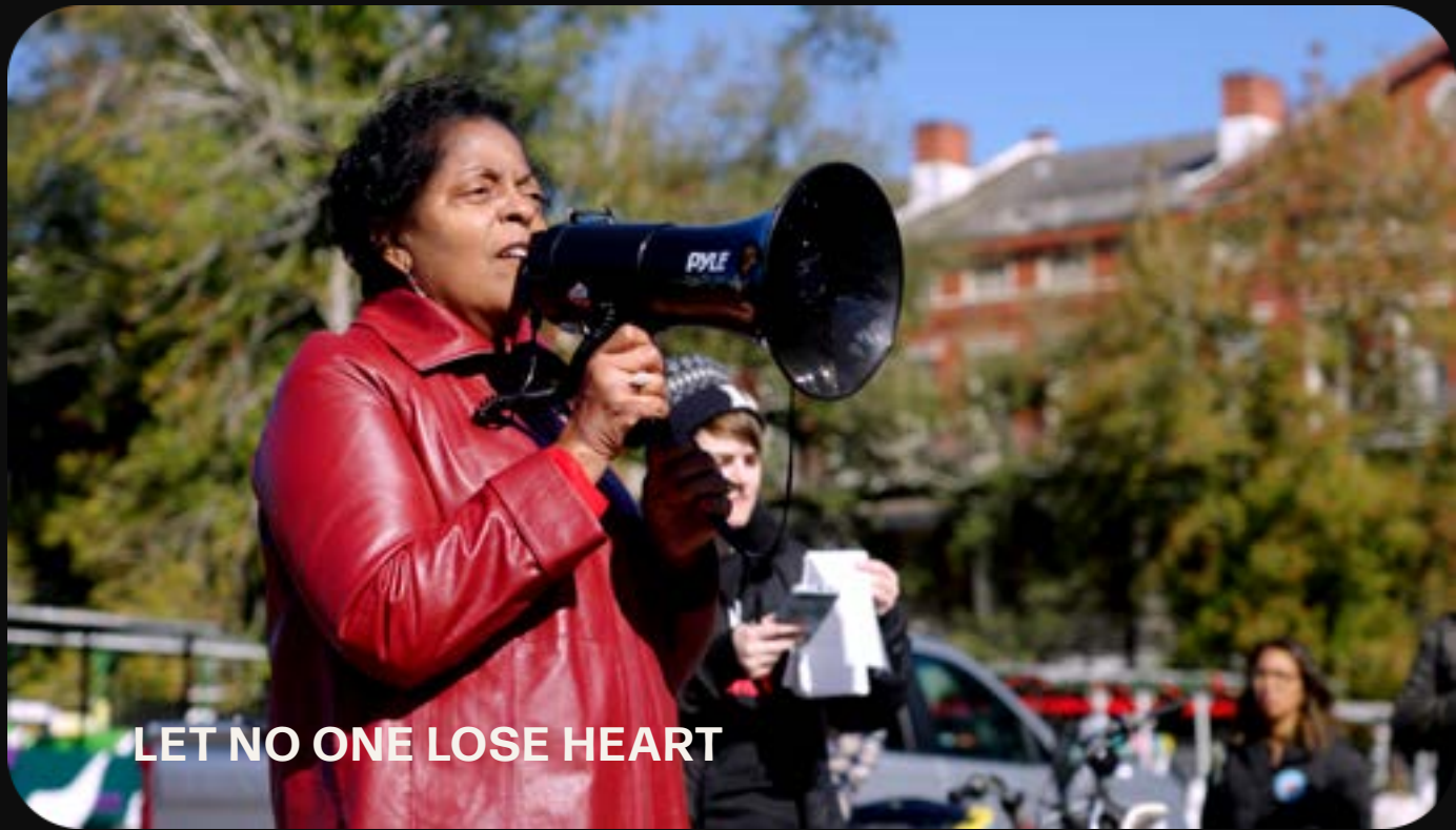
LET NO ONE LOSE HEART

Our Fiscal Sponsorship program allows media makers to raise tax-deductible donations for their projects through our extended 501(c)(3) tax-exempt status, making it one of the most powerful fundraising tools for independent filmmakers. In 2025, we onboarded 9 new fiscally sponsored films for a total of 32 active projects, and disbursed $5.5 million dollars to filmmakers through the program.