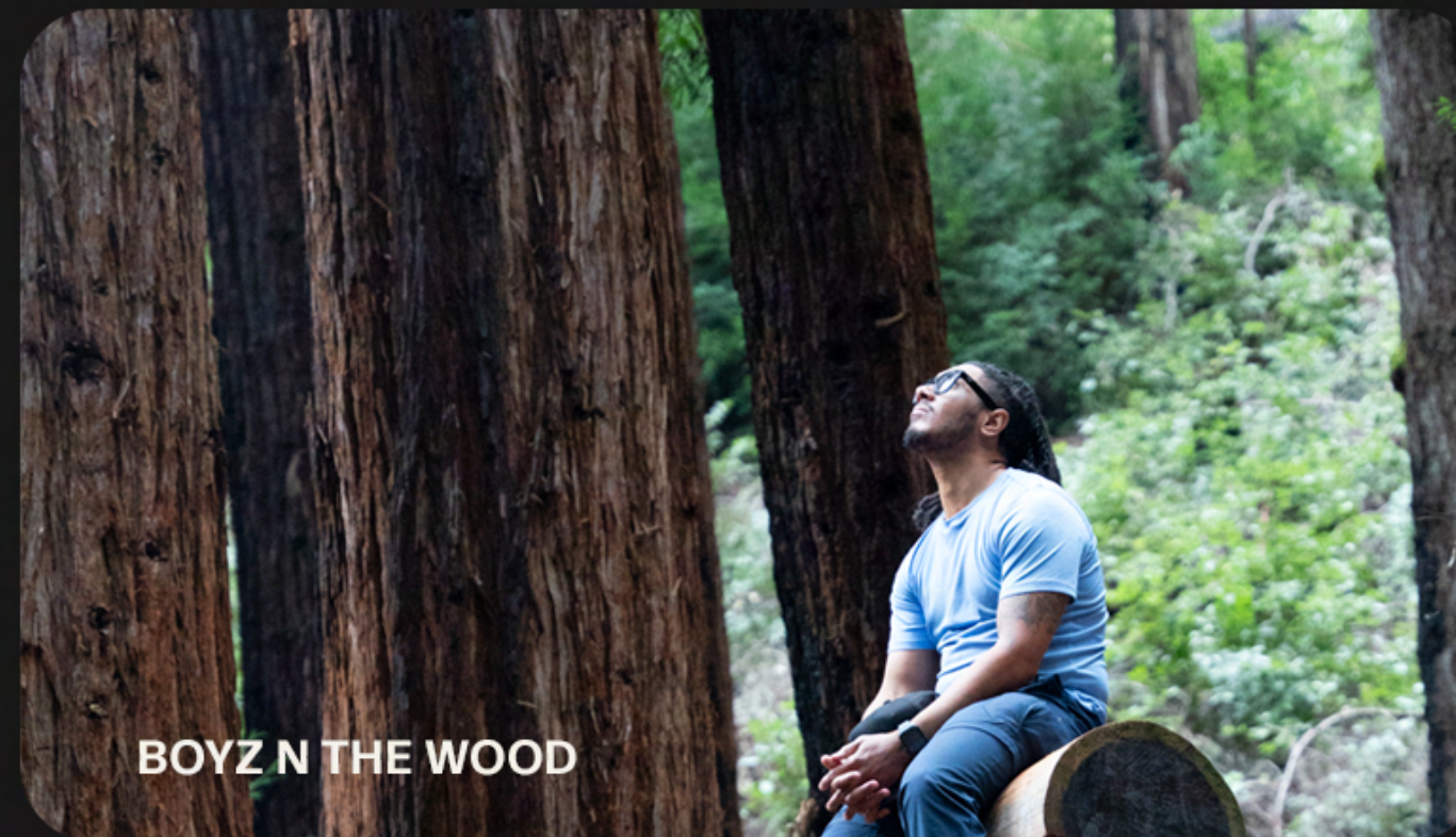
BOYZ N THE WOOD

We partnered with the REI Cooperative Action Fund to produce short films featuring organizations that break down barriers for all communities to get outdoors.