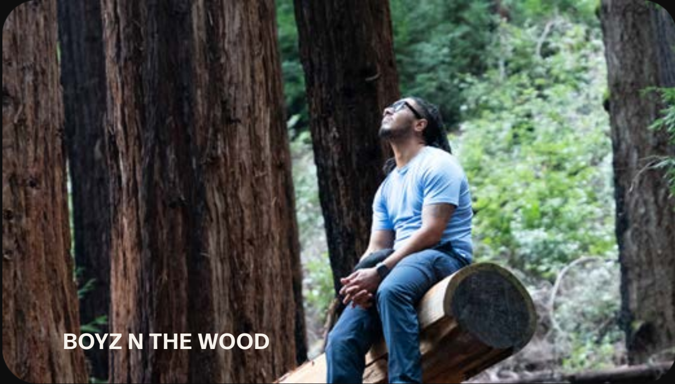
BOYZ N THE WOOD

We partnered with the REI Cooperative Action Fund to produce short films featuring organizations that break down barriers for all communities to get outdoors.